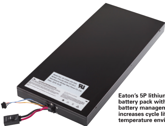
Eaton's 5P lithium-ion battery pack with on-board battery management — increases cycle life in higher temperature environments.

Building on the success of the 5P UPS platform, Eaton has reduced the weight, improved battery life and lengthened our warranty. These added benefits, in combination with the extended life of the product, provide you with the opportunity to align your UPS refresh cycles with the rest of the IT stack, saving time and money spent on labor and replacement batteries.